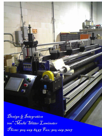
Design & Integration 100" Multi Slitter Laminator Phone: 905-669-8497 Fax: 905-669-2607